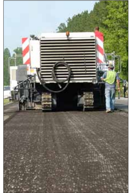
▲ Full-lane fine milling in advance of a thin asphalt overlay can result in a super-smooth product and resulting bonuses.

But there are reasons unique to thin lifts that may complicate getting density. "Check the density of the underlying mat, which will influence nuclear gauge readings on thin overlays," FHWA says in its Pavement Preservation Checklist: Thin Hot-Mix Asphalt Overlay . "If this is the case, a control strip can determine the maximum achievable density." Also, the mix nominal maximum aggregate size may be too large for the thinness of the lift. In that case, a different mix or lift depth may be indicated, FHWA says. ♦