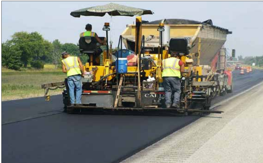
▲ In Michigan in 2005 , thin lift hot-mix asphalt pavement awaits compaction on U.S. Route 127.