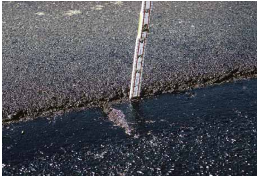
▲ Ultra-thin asphalt lift above tack coat is compacted to 3/4-inch in Michigan.

Like their thicker "big brothers," thin asphalt overlays can be dense-graded, open-graded or stone matrix asphalt. Open-graded overlays allow surface