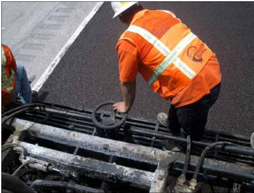
▲ Micro surfacing poses a strong competitor to thin hot-mix asphalt overlays, but must be placed using modified spreader trucks.

"The structural coefficient work done by NCAT was intended for overall pavement design, for building full-depth or deep-strength pavements," Newcomb continues. "When a thin lift overlay is planned, normally a structural design is not made; they are there for a different reason. The pavement structure has to be adequate in the first place, and if it's not, you will have to go with a thicker overlay to get that kind of improvement."