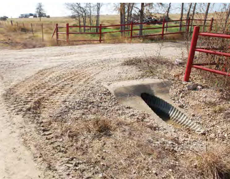
Well-built and maintained culvert keeps water off both unpaved roadways.

The use of motorized vans carrying ground penetrating radar (GPR) is well-established in characterizing the subsurface conditions of road networks as road agencies update their pavement condition inventories, but in 2012 researchers at the University of Illinois at Urbana-Champaign described use of GPR for unpaved roads.