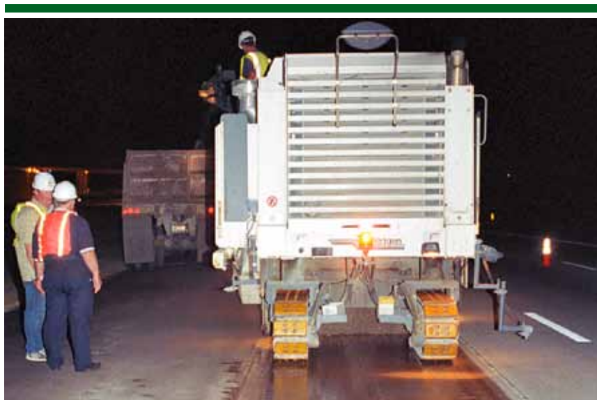
▲ TexOp Construction uses a fine-toothed drum to prep President George Bush Turnpike near DFW Airport in advance of NovaChip overlay; the contractor alternative provided significant savings over diamond grinding originally planned by owner North Texas Tollway Authority.

Prior to commencement of the work, Georgia DOT requires a 1,000-foot test section with uniformly-textured surface and cross section as approved by the engineer.