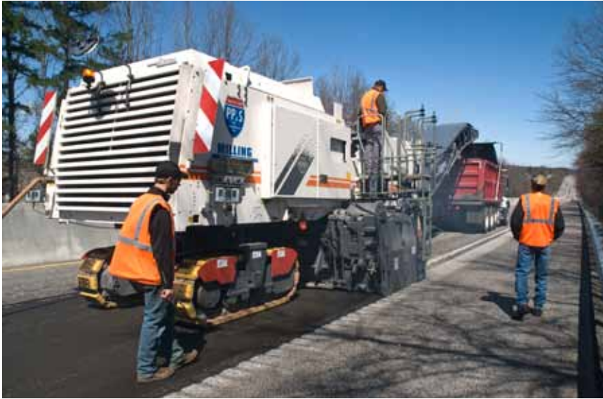
▲ Control systems and a full lane-width, fine-mill drum allows Pavement Products and Services to correct pavement cross-slope using micromilling on I-185.