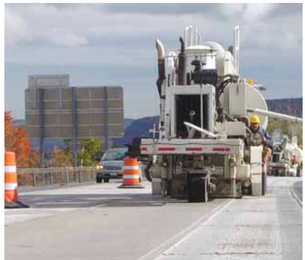
▲ Diamond grinding is applied to I-88 near Albany, N.Y.

Early in 2011, new NGCS test sections were constructed at the Virginia Tech Transportation Institute's Smart Road test facility near Blacksburg, Va. In January, three test strips