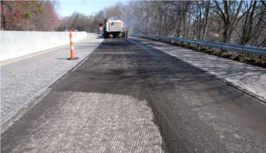
▲ Micromilling, or fine milling, by Pavement Products and Services, provides super-smooth base for overlay while correcting cross-slope problems on I-185 in Greenville, S.C.