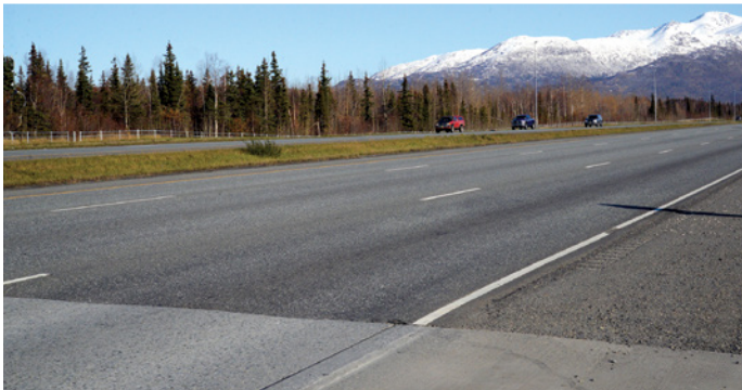
HiMA mix, eastbound Glenn Highway Alaska S.R. 1 at weigh station near Eagle River shows minimal studded tire rutting after two years

So following the successful performance of the 5th and 6th Avenues in Anchorage, Alaska DOT&PF specified the same PG 64E-40 HiMA binder grade for resurfacing of the Glenn Highway.