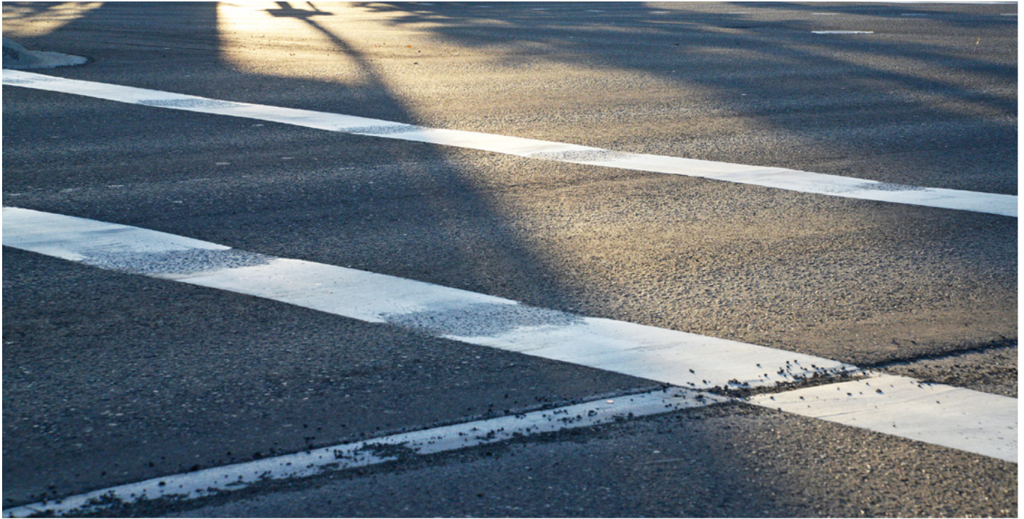
Undulating transverse shadows across rutted pavement -- and gouged intersection striping -- shows rut damage caused by studded tires on Minnesota Avenue in Anchorage

Rutting caused by studded tire wear is a serious problem in the American Pacific Northwest, costing the states of Oregon, Washington and Alaska millions of dollars annually in damage to both asphalt and Portland cement concrete roads.