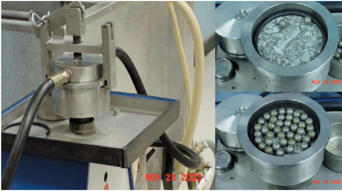
Alaska DOT&PF's Prall tester for studded tire damage

In North America, typical SBS-modified asphalt binders contain 2 to 4 percent SBS modifier. In contrast, the strict, performance-related specifications for HiMA usually requires 7.5 to 8 percent SBS. HiMA binders result in a significantly more durable pavement with a rubber-like flexibility to recover from the indentations created by the tire studs, while retaining mix workability during placement. In milder climates, research and experience have shown that HiMA binders result in mixtures with much greater resistance to rutting and fatigue cracking than other binders.