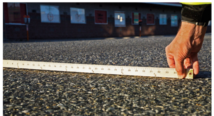
After four winter seasons (2015-2019), 200 block of E 5th Avenue with HiMA-modified PG 64-40 E binder shows minimal rutting

The wheel paths look dark much like the Prall test specimens, indicating that roughly the same behavior is occurring in the laboratory and in the field. The Alaska DOT&PF is pleased with the performance and is specifying more projects with modified PG 64-40 E binder and hard aggregates, designated as Hot Mix Asphalt, Type VH by Alaska DOT&PF.