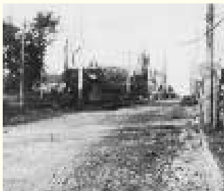
A Raleigh, N.C., city street, macadamized as an object-lesson road during a 1902 state "good roads" convention.