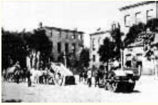
Construction of the first object-lesson road in 1897 near the New Jersey Agricultural College & Experimental Station, New Brunswick, N.J.

Michigan. Throughout most of the 1900s, ARM's president was James H. MacDonald, state highway commissioner for Connecticut.