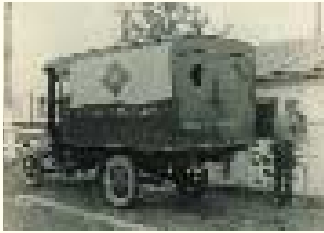
A turn-of-the-century New England bakery truck relied on good roads to make deliveries. Photo undated.

highway commissioner and head of the early ARTBA, Earle rode the circuit in defense of improved roads, hearing obstinacy much of the way. "The farmers, in certain localities, were so bitterly opposed to good roads they would not permit good roads to be built, even when constructed without any cost to them," he wrote. "Farmers went to the polls carrying banners reading, 'Don't vote your farms away.'"