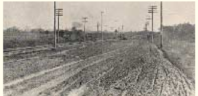
The Washington (D.C.) & Alexandria (Va.) Turnpike, main thoroughfare between the two cities in 1894.

ARM was a public/private partnership before those buzzwords had any meaning. Government agencies were a core element of both ARM and the League of American Wheelmen. Earle himself was a road commissioner in