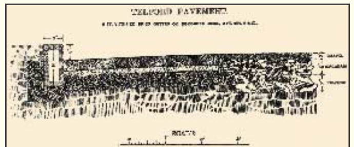
Cross-section of Telford pavement from an engineering drawing submitted by the City of St. Louis, Missouri, for publication in an October 1897 supplement to Scientific American .