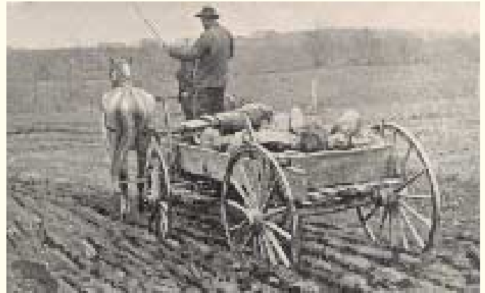
A mud road in Canandaigua, N.Y., 1894.

the League in 1899, the organization dropped bicycle racing and adopted good roads as its main mission. Its first International Good Roads Congress was held at Port Huron, Mich., in July 1900.