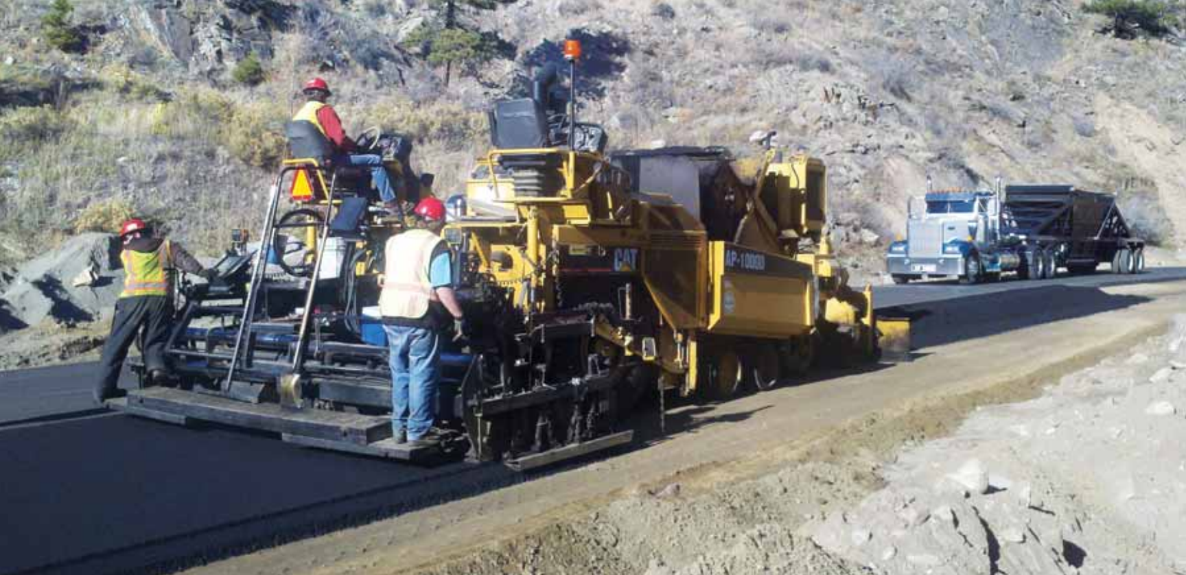
To maintain asphalt workability, forces of Coulson Excavating pave U.S. 34 between Loveland and Estes Park with warm-mix asphalt due to long hauls of up to three hours, low ambient temperatures at the end of the season and high elevations.