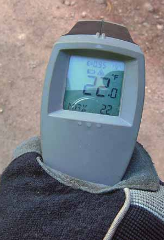
In late October, prepared base for U.S. 34 emergency repair registered at 22° F.