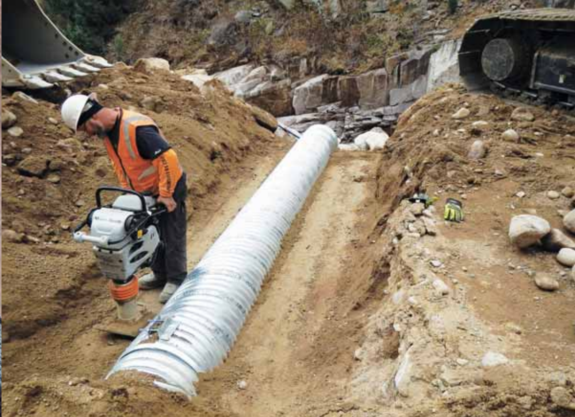
Corrugated metal culvert is installed to restore drainage as part of emergency reconstruction of highways in Colorado's Front Range.

Lawrence Construction, with paving subcontractors like Coulson Excavating (Loveland), APC Construction (Golden) and Aggregate Industries (Denver).