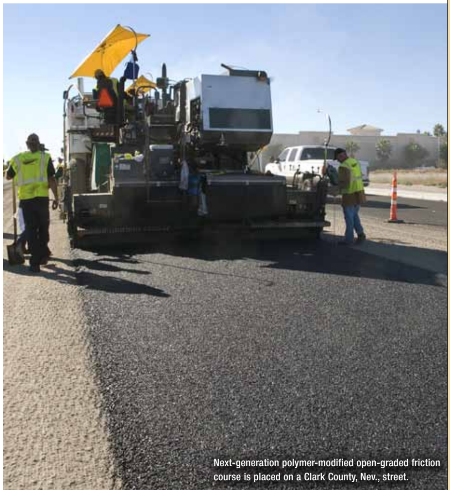
Next-generation polymer-modified open-graded friction course is placed on a Clark County, Nev., street.