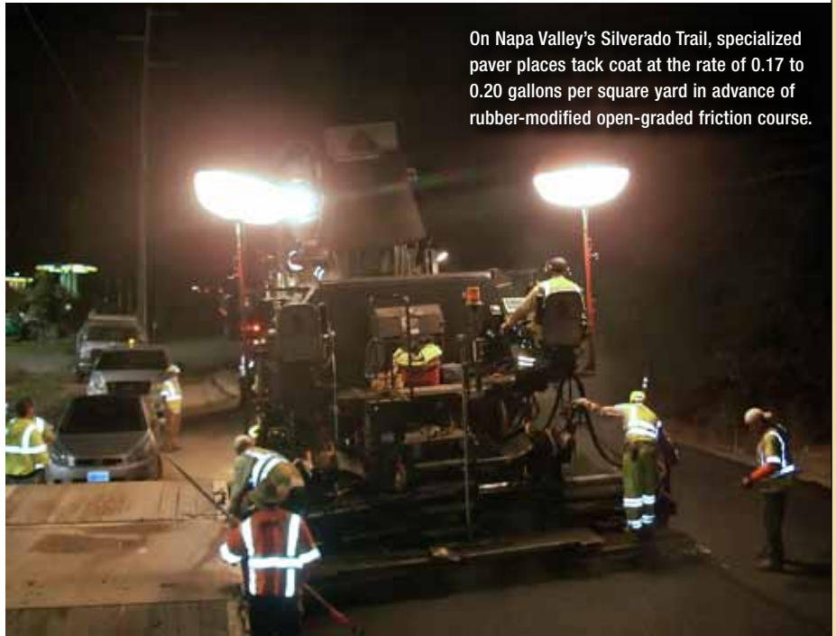
On Napa Valley's Silverado Trail, specialized paver places tack coat at the rate of 0.17 to 0.20 gallons per square yard in advance of rubber-modified open-graded friction course.

In addition to sharing all the advantages of OGFC with its polymer-modified counterpart, rubber-modified OGFC also costs slightly less than conventional polymer-modified OGFC, ARTS says, adding when used in OGFC, scrap tires can be used at a rate of approximately 1,000 tires per mile of two-lane pavement.