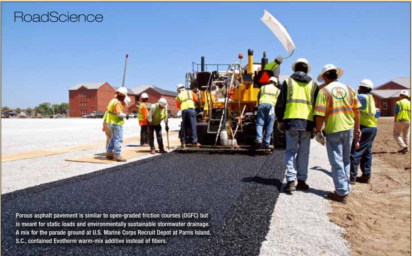
Porous asphalt pavement is similar to open-graded friction courses (OGFC) but is meant for static loads and environmentally sustainable stormwater drainage. A mix for the parade ground at U.S. Marine Corps Recruit Depot at Parris Island, S.C., contained Evotherm warm-mix additive instead of fibers.

majority of agencies report good experience using modified asphalt binders," Kandhal and Mallick say.