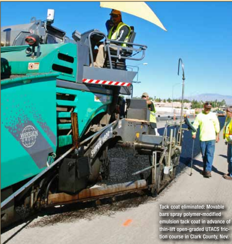
Tack coat eliminated: Movable bars spray polymer-modified emulsion tack coat in advance of thin-lift open-graded UTACS friction course in Clark County, Nev.

Static compaction with two double-drum rollers followed the paver. "You have to run two rollers because you need to hit the temperature range on compaction, which is 180 to 280 degrees," Meyers says. "That thin lift behind the screed is cooling fast, and