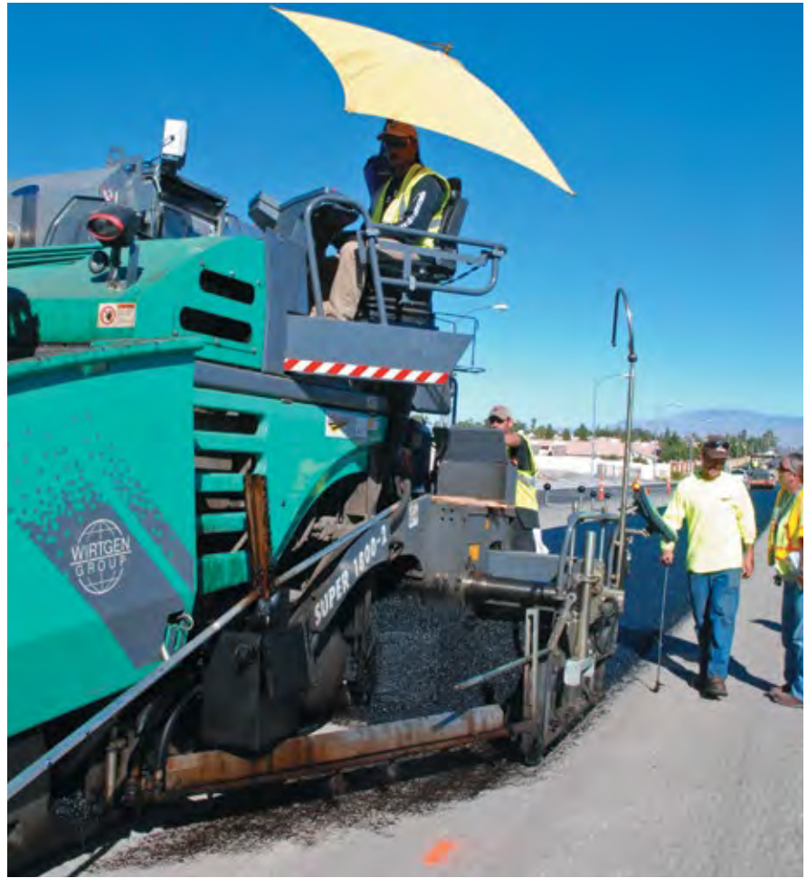
Spray bars on paver of Las Vegas Paving Corp. place asphalt emulsion bond coat in advance of ultrathin bonded overlay

In addition to enhancing friction, such gap-graded and open-graded mixes