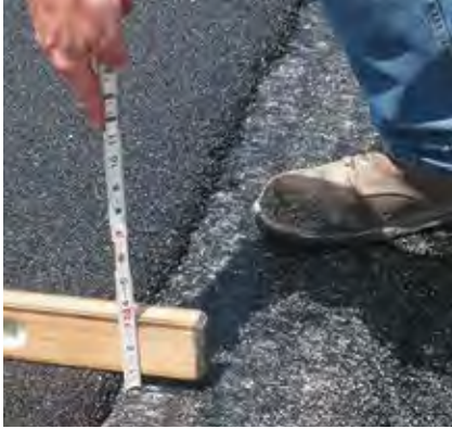
One inch of stone matrix asphalt (SMA) Thinlay is placed in Bryan, Tex.; paver used Pave-IR system to detect uniformity of mat temperature, control of which critical for thin asphalt lifts